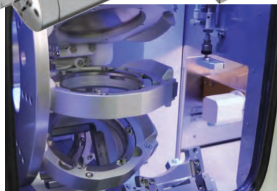
For continuous operation and high accuracy, The Versamill 5X500L features a 20-station automatic cartridge changer with zero-point fixturing.